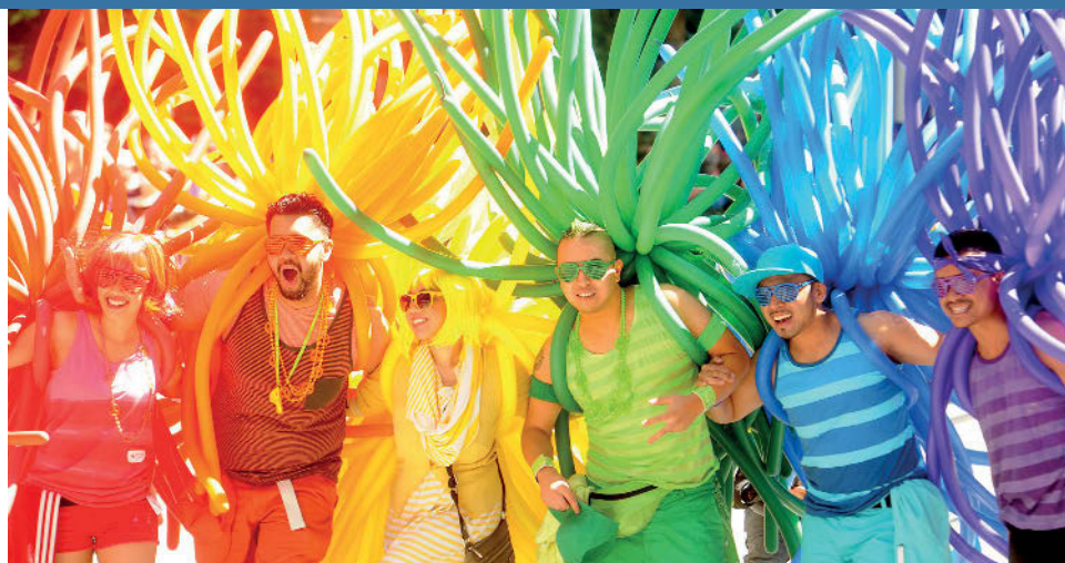
Revelers with balloons create a human rainbow during San Francisco’s 42nd annual Gay Pride Parade in 2012.

families, educating communities and advocating for change.