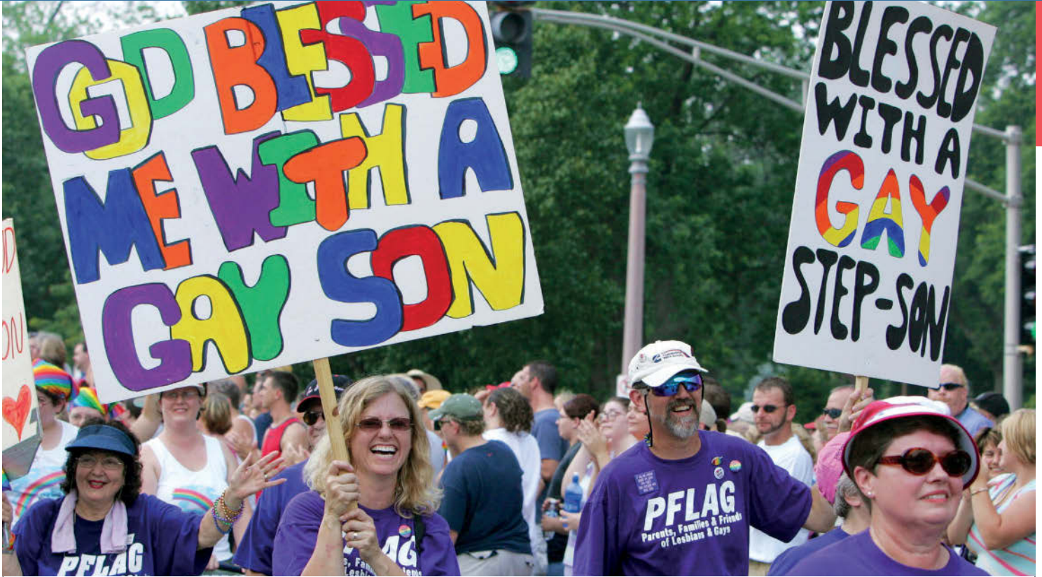
Members of PFLAG march with their signs in the PrideFest 2005 parade in St. Louis.

Despite recent legal and social progress, lesbian, gay, bisexual and transgender (LGBT) individuals continue to face intolerance and inequality around the world. LGBT youth in particular face discrimination, harassment and violence in their communities, at school and at home. In short, many of them live in fear.